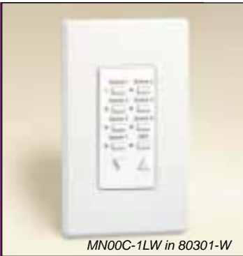
MN00C-1LW in 80301-W

Note: A Repeater must be used on any installation that uses more than one circuit.