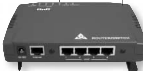
4 Port 10/100 Router/Switch

Supports sharing of a high-speed Internet connection among home computers