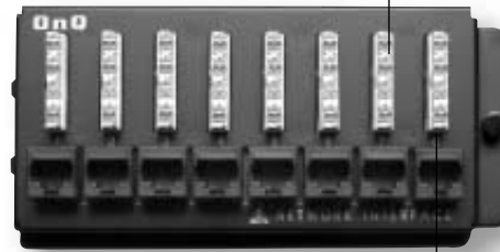
8 Port Network Interface Module

Supports high-speed Category 5E termination points for interconnections to digital data services