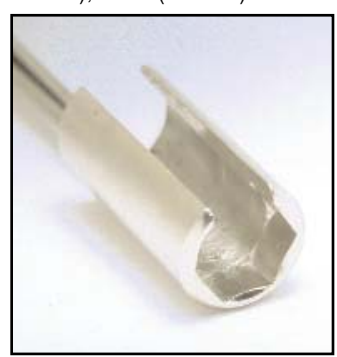
Allen Tel Products now offers an easy-to-use hand tool that quickly cuts time and improves the assembly, installation, and removal of F-Connectors. The CT777 Tool is designed with the installer in mind. The sure grip handle fits comfortably in your hand to both install and remove connectors on the jacks as well as installing the F-Connector to the coax.