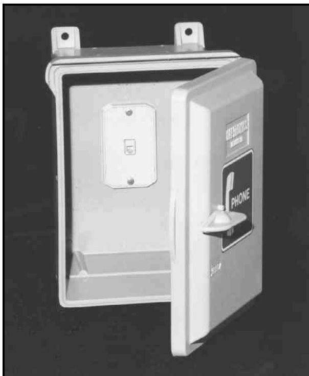
Model 255 Enclosure with Modular Wall Phone Jack

GAI-Tronics Corporation offers a full line of Industrial Telephone Enclosures to protect telecommunications equipment in harsh environments. These enclosures are ideally suited for outdoor use, for areas with harsh or corrosive chemicals, or any environment where protective housing is required.