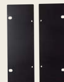
RPK84 Rack Mount Kit