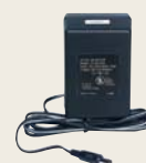
PCMPS2 Power Supply (12V)