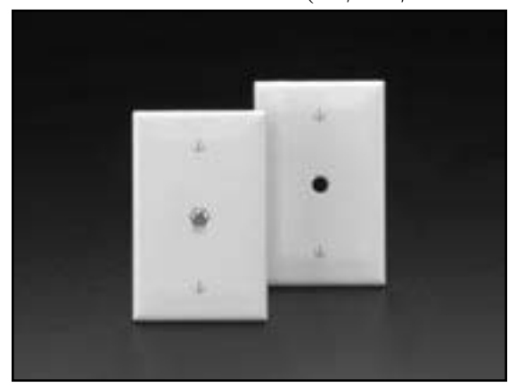
For ELECTRONIC Typical Specs see (.TXT) file on disk.

See ELECTRONIC FILES for CAD files (.DXF, .DWG, MS-DOS.EPS) on disk