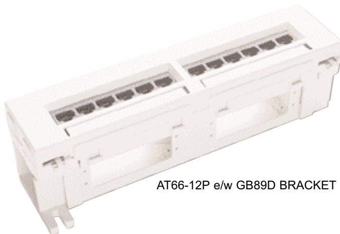
AT66-12P e/w GB89D BRACKET