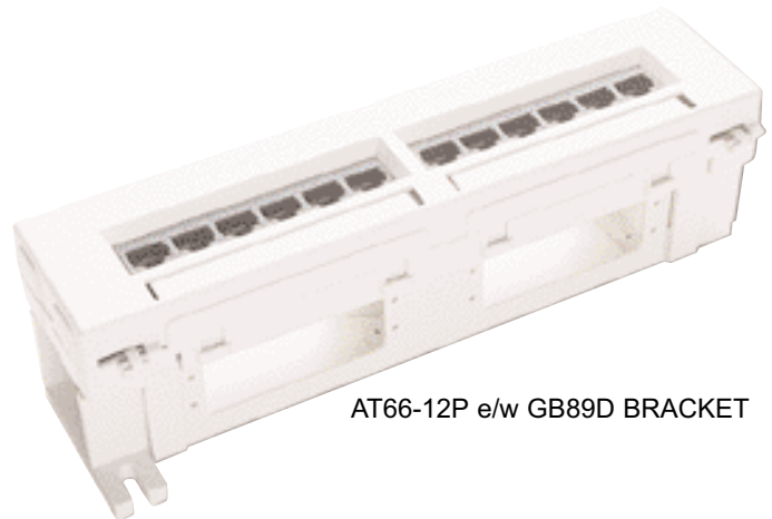
AT66-12P e/w GB89D BRACKET