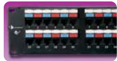
Icon and label holder kits are included with every panel

S110® termination openings on the rear are compatible with S110 patch plugs