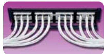
Integrated rear cable manager properly guides cables to and from the rear of the panel

The most economical way to order HD5 panels is in bulk project pack with universal T568A/B wiring option