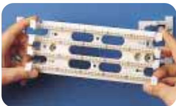
The tabs for removing the detachable legs on the 100-pair block are located on the face of the block to simplify removal

S110 ® connecting blocks come in 2-, 3-, 4-, or 5-pairs