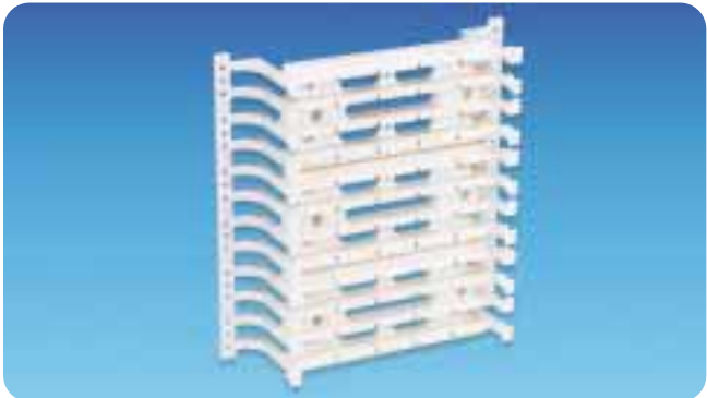
S110AW2-300.....300-pair, S110® wiring block with legs