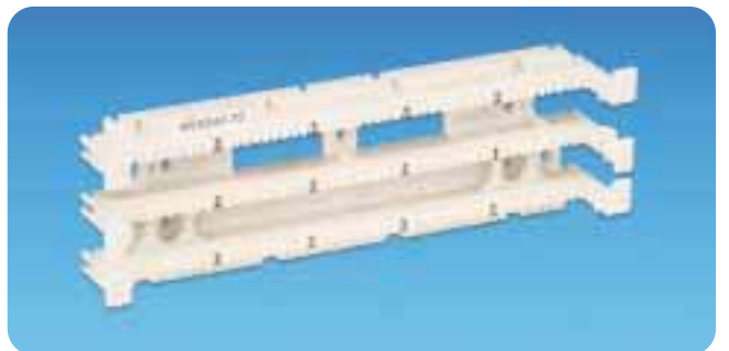
S110DW1-75.....75-pair, S110® wiring block