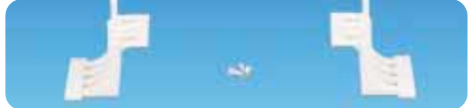
S110L2-100 .....100-pair, S110® mounting legs, (1 set of 2)