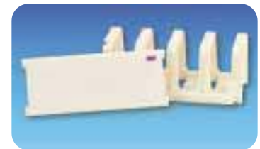
1 or 2 RMS S110 ® cable managers can be ordered with or without mounting legs. Optional covers are available separately for 50- and 100-pair sizes