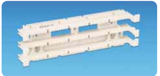
S110DW1-75.....75-pair, S110® wiring block