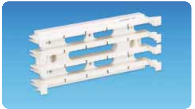
S110DW2-100.....100-pair, S110® wiring block