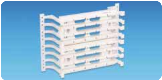
S110AW2-200.....200-pair, S110® wiring block with legs