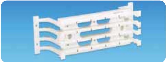
S110AW2-100.....100-pair, S110® wiring block with legs