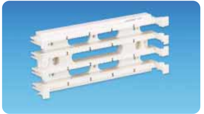
S110DW2-100.....100-pair, S110® wiring block