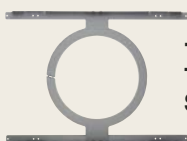
TBCR Tile Bridge Support Ring