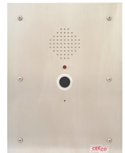
SSP-561-D or X

Providing Telecommunication Solutions Since 1930