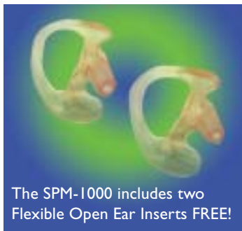
The SPM-1000 includes two Flexible Open Ear Inserts FREE!