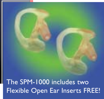
The SPM-1000 includes two Flexible Open Ear Inserts FREE!