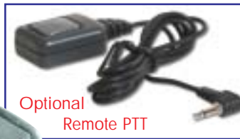
Optional Remote PTT